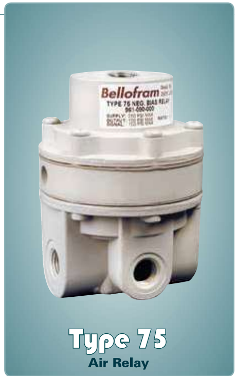
Type 75 Air Relay