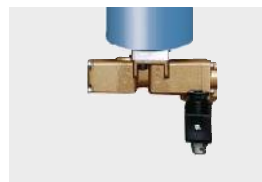
Option: Purge stop valve

the desired pressure dew point. In the model HMM, the membrane bundle is located in a pressure-resistant housing. This construction offers the possibility to interrupt the purge air flow by means of an optionally-mounted solenoid valve, which can be operated from the compressor on-off contact.