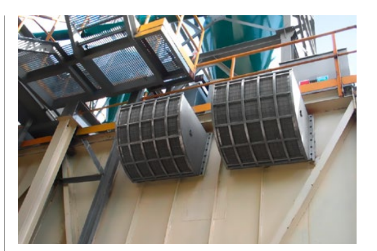
Explosion venting of a chip bunker using the Q-Box to protect the surrounding infrastructure.

The sanitary cover protects the Q-Box against dust from outside sources.