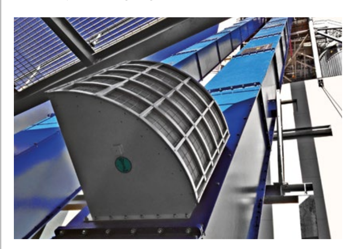
Explosion Safety of a trough chain conveyor using the Q-Box in a biomass power plant.

Consulting. Engineering. Products. Service.