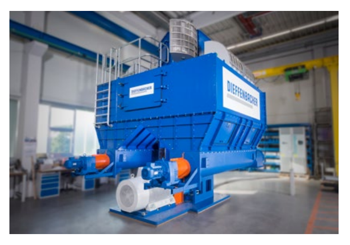
Flameless explosion venting in a grinder machine.